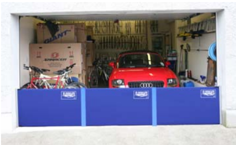
Garage door protection

Over the past 3 years, Floodgate has been working closely with a dedicated team from JT Atkinson builders’ merchants in Penrith, to help supply the local community with a range of products to suit all their flood protection requirements.