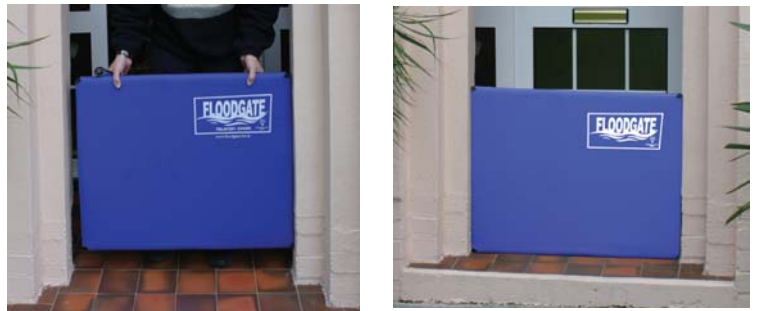
Deploying Floodgate on flood warning

The collaboration has so far successfully supplied over 1,000 units to various government bodies, companies and individuals in the Cumbria and North West area.